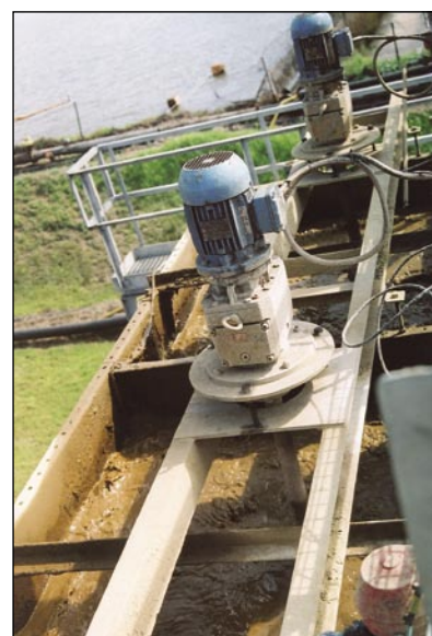
The CSIR lime/limestone process is used to increase the pH of the water prior to ultrafiltration.