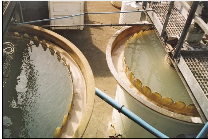
After the pre-treatment process the water is clarified before being sent through the ultrafiltration membranes.

In addition, a series of community meetings have been held to appease any fears the people of Emalahleni might have with regard to drinking treated mine-water. Tshwete says communities have been well informed, and a regular newsletter, in