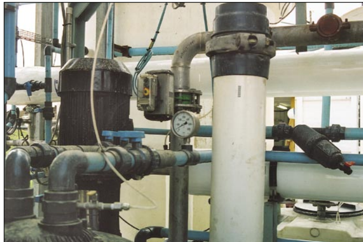
Spiral reverse osmosis (RO) membranes are used to remove salinity in the water. Up to 500 RO membranes will be installed on the main plant.

which people can comment on the project, and where queries can be answered, has been suggested to allay any future concerns.